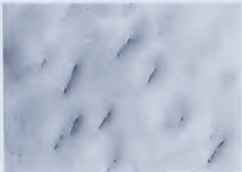
Figure 5 Surface structure of Aepyornis eggshell. Note the long slit-like structures into which the pores open. This type of structure is exactly what is seen in the Cervantes egg (x20).

is possible that one or both of the eggs arrived near Australia aboard ship and with shipwreck ended up on Western Australian beaches, travelling only a short distance. We note that at the location of the Scott River egg, in the dunes near Augusta, there have been no records of early shipwrecks